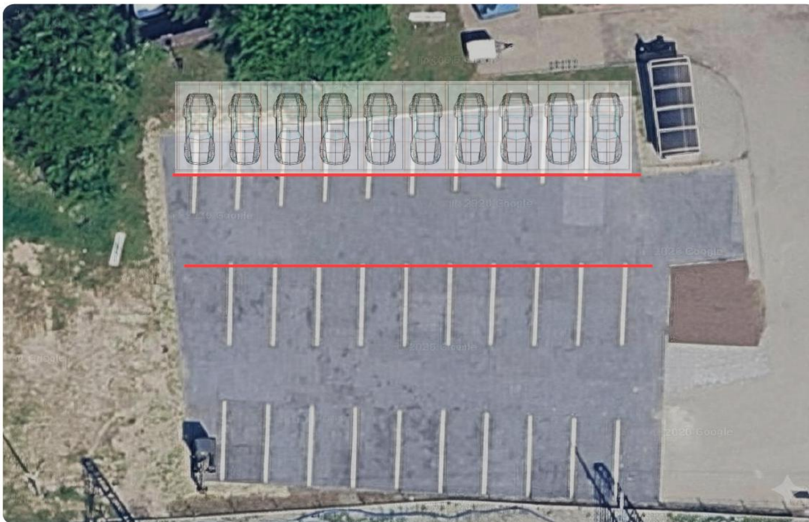
Rysunek nr 1. Położenie carportu względem powierzchni parkingu.